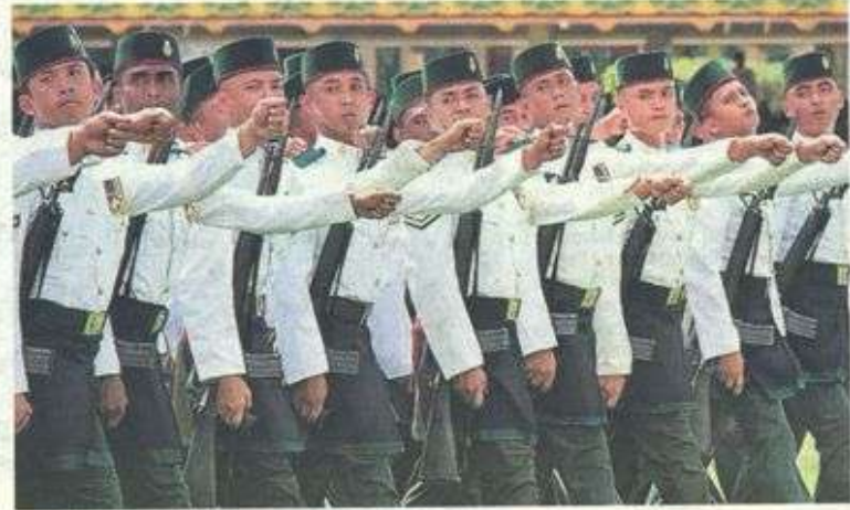
(Left) His Majesty greets well-wishers during the Gurkha 200 Commemoration Parade. (Above) Royal Brunei Land Force personnel march during the Gurkha 200 Commemoration Parade at Taman Hj Sir Muda Omar 'Ali Saifuddien.