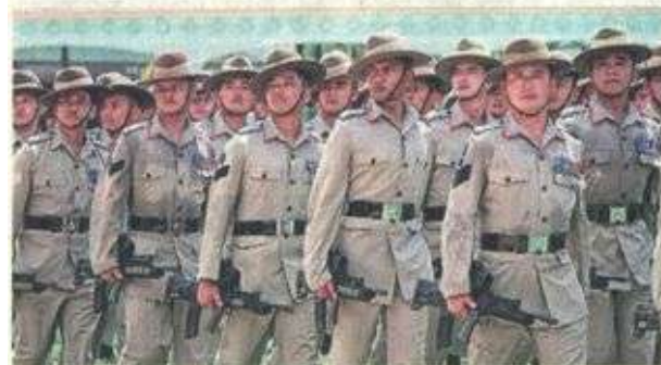
The Brigade of Gurkhas personnel during the Gurkha 200 Commemoration Parade at Taman Hj Sir Muda Omar 'Ali Saifuddin.

"You can see (from) today, the manifestation of our close relationship because (even though we practise) different drill movements, at the end of the day we were able to put up an excellent parade," he said.