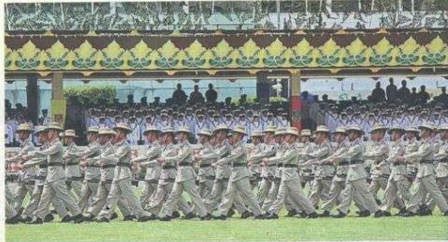
(Above) Brigade of Gurkhas personnel march during the Gurkha 200 Commemoration Parade at Taman Hj Sir Muda Omar 'Ali Saifuddien. (Left) An elderly woman waves a mini national flag during the parade.